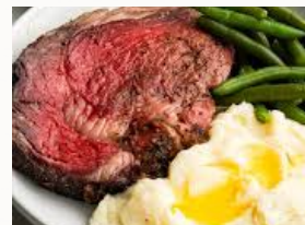
Prime Rib, Garlic Mashed and String Beans

Includes: Tossed Salad and Fresh Baked Rolls