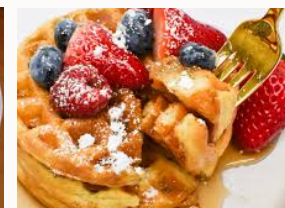
Warm Waffles with Blueberries & Strawberries