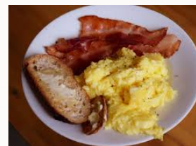
Scramble Eggs with Applewood Bacon