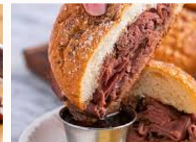
Roast Beef on a fresh Kimmelweck Roll