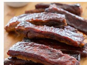
Mouthwatering Spare Ribs

Includes: Tossed Salad, Fresh Baked Rolls