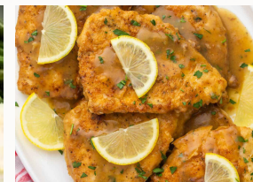
Delicious Chicken French and String Beans